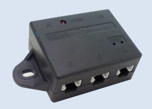
1000-MJM (Multi-Lock Junction Module)