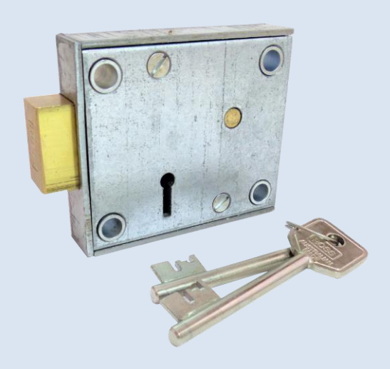
406-BFL/R30 Safe Lock

The <u>406-Series 'Block' Safe Lock</u> was targeted at the Grade-A Security rated units of the day. Based on the 400-Series 'open-gate' pick resistant serrated lever, the (4) corner fixing ferrule holes made the installation task a simple one.