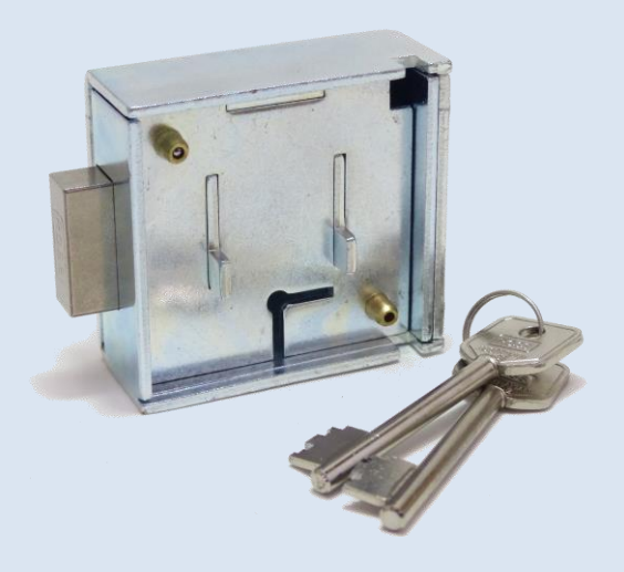
600-AL/R30 Safe Lock

The arrival of the <u>600-Series Safe Lock</u> in 1990 provided the opportunity to present an advanced safe lock design that endeavours to eliminate the conventional lock weakness and obstruct the traditional opening and drilling intrusion techniques.