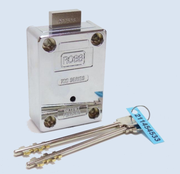
700-SERIES/RDB65 Retrofit Safe Lock