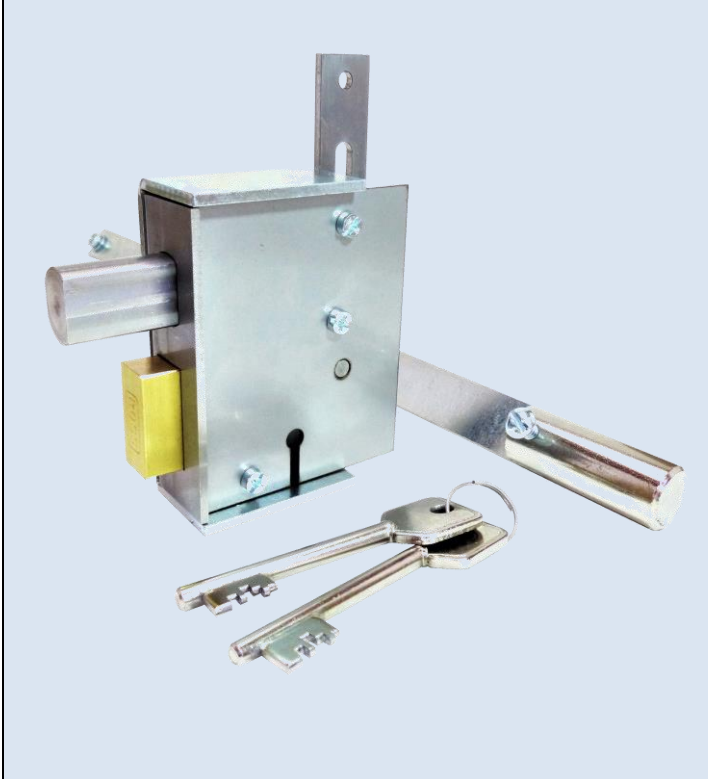
900-WCL/R30 Cabinet Lock

The installation of this lock avoids any drilling threading or screws by simply welding the lock cover directly onto the door. Safe manufacturers and gun cabinet makers alike recognise and welcome the smooth operation and the economics that comes with this lock.