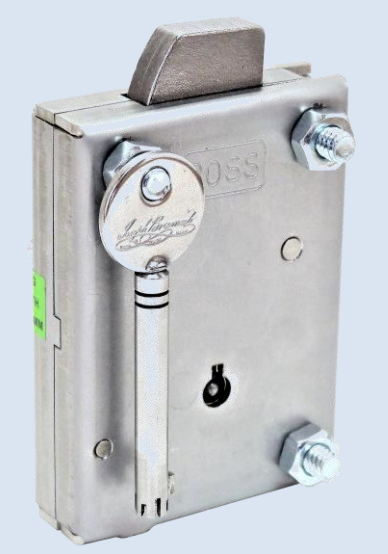
1000-LK6 (Bramah) Safe Lock