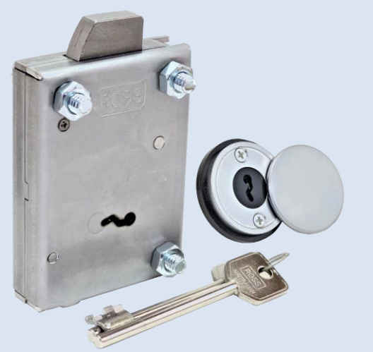
1000-LK5 Safe Lock with Escutcheon and 'Wave' keyhole Insert

This unit is patented and Australian Made