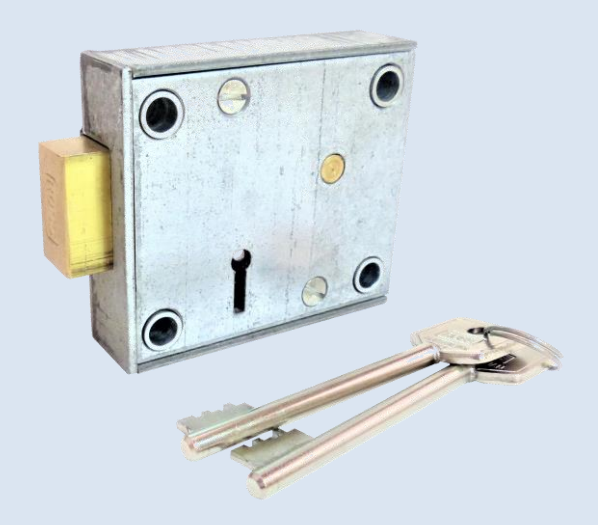
408-BFL/A50 Safe Lock

The <u>408-Series 'Block' Safe Lock</u> was also targeted at the Grade-A Security rated units of the day. For additional security the (8) lever version with an extra two (2) 400-Series 'open-gate' pick resistant serrated lever added. The (4) corner fixing ferrule holes made the installation task a simple one.