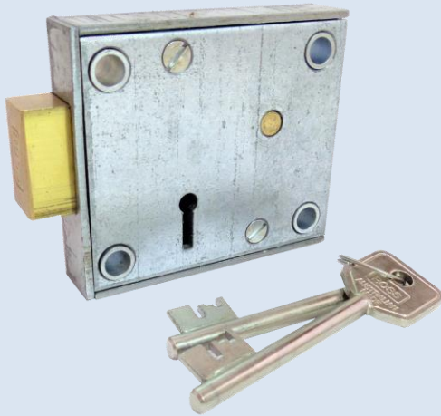
406-BFL/R30 Safe Lock

The 406-Series 'Block' Safe Lock was targeted at the Grade-A Security rated units of the day. Based on the 400-Series 'open-gate' pick resistant serrated lever, the (4) corner fixing ferrule holes made the installation task a simple one.