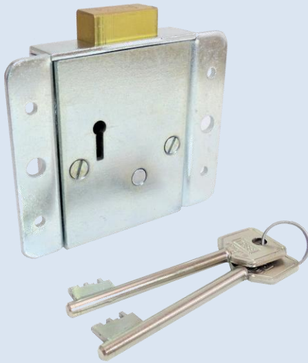
406-W/R40 Safe Lock

The 406-Series 'Winged' Safe Lock is the winged lock option that again targeted the Grade-A Security rated market of the day. Again, this lock is based on the 400-Series 'open-gate' pick resistant serrated lever.