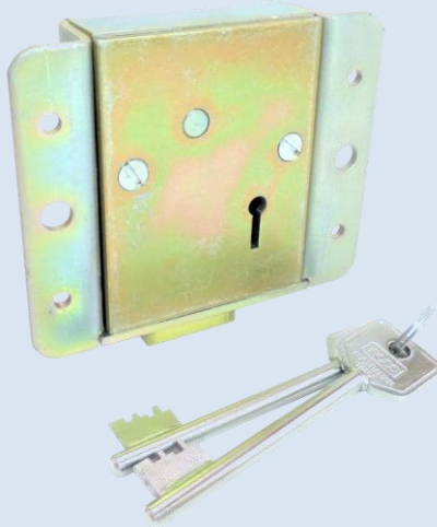
408-WD/R40 Safe Lock

The 408-Series 'Winged' Safe Lock was also targeted at the Grade-A Security rated units of the day. For additional security the (8) lever version with an extra two (2) 400-Series 'open-gate' pick resistant serrated lever added. The (4) corner fixing ferrule holes made the installation task a simple one.