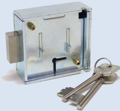
600-AL/R30 Safe Lock

The arrival of the 600-Series Safe Lock in 1990 provided the opportunity to present an advanced safe lock design that endeavours to eliminate the conventional lock weakness and obstruct the traditional opening and drilling intrusion techniques.